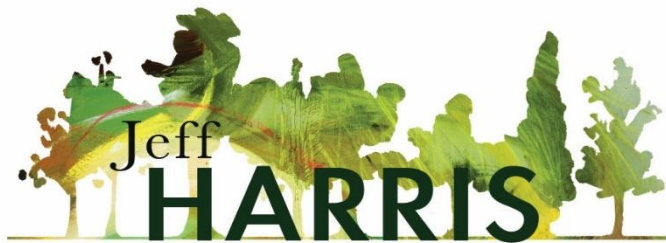
CITY COUNCILMEMBER, DISTRICT 3